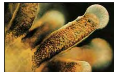
Zooxanthellae in coral polyps

Coral bleaching is a stress response that occurs when the coral-algae symbiotic relationship breaks down. The term 'bleaching' describes the loss of color that results when zooxanthellae are expelled from the coral polyps or when chlorophyll within the algae are degraded. When the zooxanthellae leave the coral, the white of the coral skeleton is then clearly visible through the transparent coral tissue, making the coral appear bright white or 'bleached'. Some corals, such as our lobe coral, have additional pigments in their tissue, so when they 'bleach' they may turn a pastel shade of yellow, blue or pink rather than bright white.