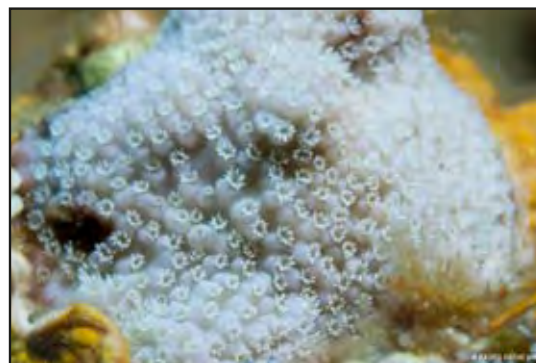
Bleached coral polyps

Coral bleaching is a stress response that occurs when the coral-algae symbiotic relationship breaks down. The term 'bleaching' describes the loss of color that results when zooxanthellae are expelled from the coral polyps or when chlorophyll within the algae are degraded. When the zooxanthellae leave the coral, the white of the coral skeleton is then clearly visible through the transparent coral tissue, making the coral appear bright white or 'bleached'. Some corals, such as our lobe coral, have additional pigments in their tissue, so when they 'bleach' they may turn a pastel shade of yellow, blue or pink rather than bright white.